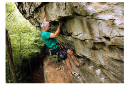
1,000 acres of recreation in the Urban Wilderness

Knoxville is Tennessee's third largest city, situated along the Tennessee River. Knoxville is an outdoors town, a college town, a brewery town, an arts town, a foodie town, and a dog-friendly town. You might hear us called the Maker City, Marble City or Scruffy City, and we'll own all of them. We have a moderate climate and a cost of living 15% below the national average.